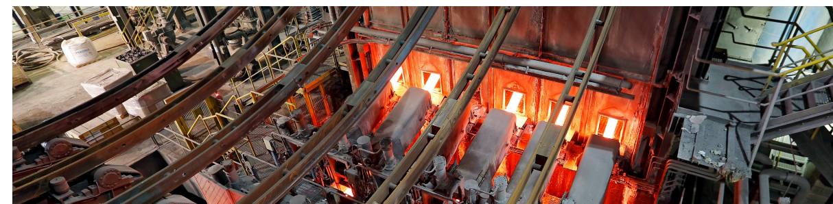
European leaders in special long steels

Join us and experience the combination of stability and trajectory. At Sidenor, we invest in your future as much as you do.